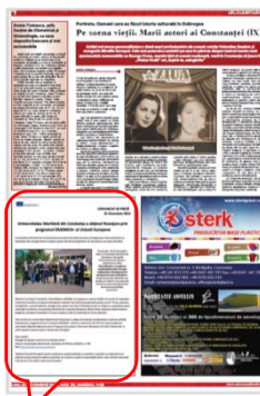
Local newspaper, Ziua CT, 2016