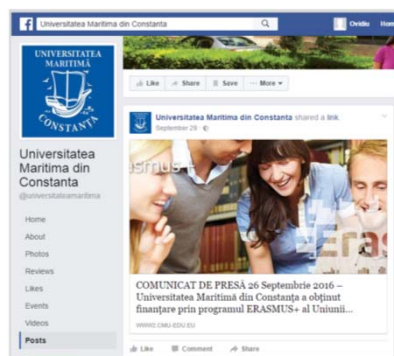
CMU Facebook page, Sept 2016