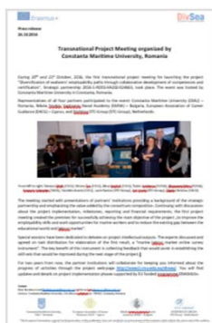
CMU Website, Oct 2016