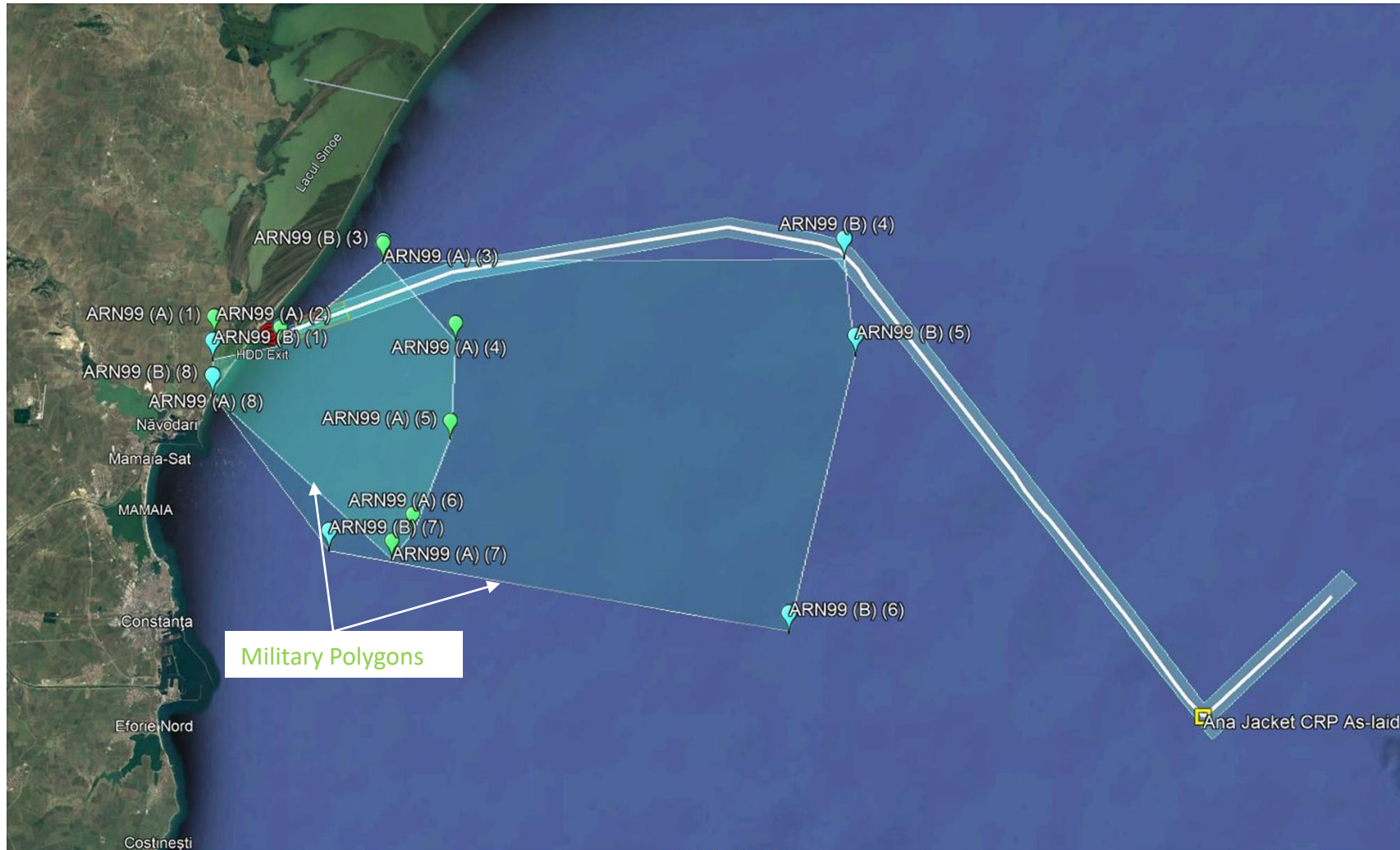
126 km offshore pipeline ROW from Ana Platform to shore